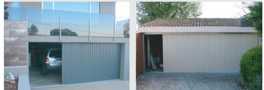
Perfect for underneath garage