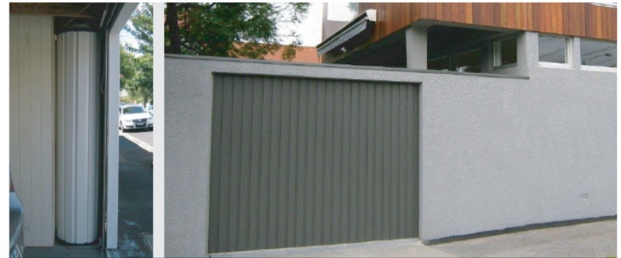
Tucks away neatly in a corner